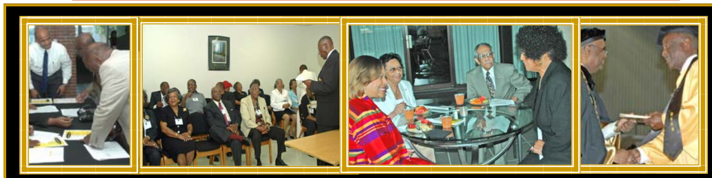
Pictures of activities associated with the 50th-Year Reunion: Registration, Class Meeting, Get Acquainted Activity, and Graduation