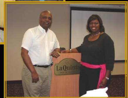
Photos from the Chapter meetings in Houston, Texas